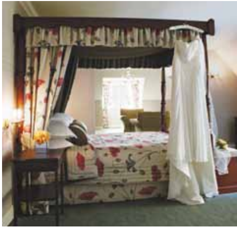
Bridal Suite at Warren Weir