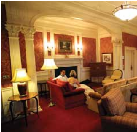
Queen Elizabeth Suite, Mansion House