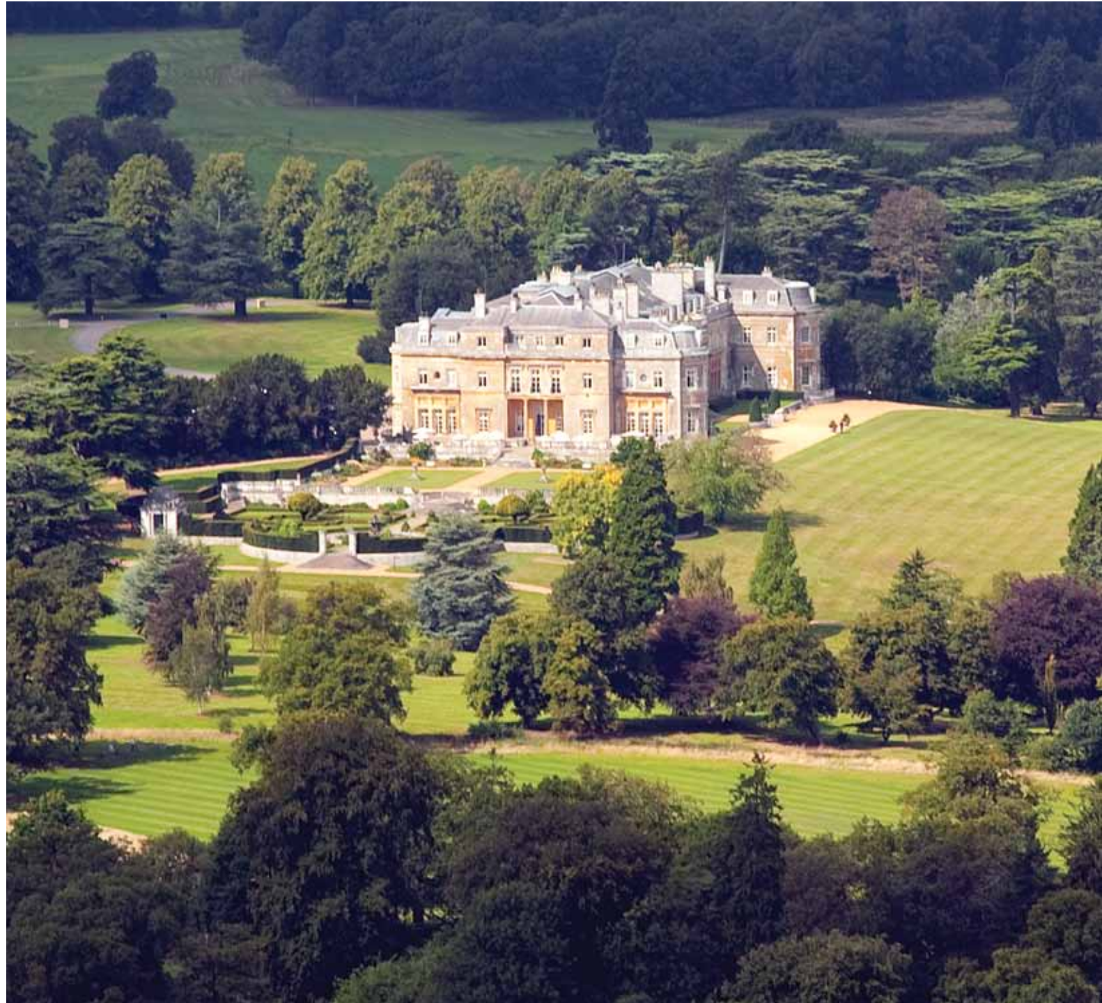
The Mansion House set in 1065 acres