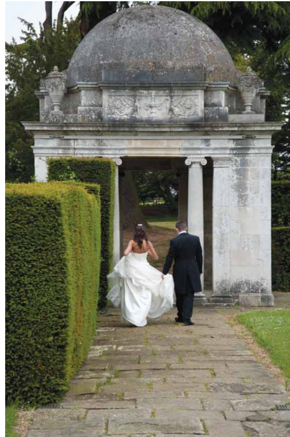
The gardens provide plenty of photographic opportunities