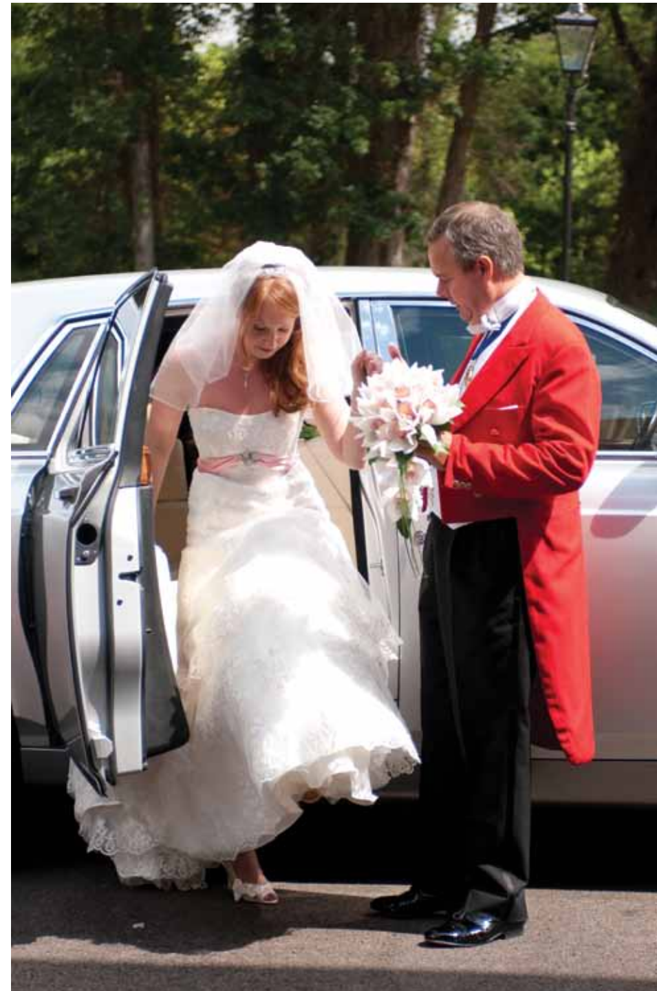
Our toastmaster ensures the smooth running of your day