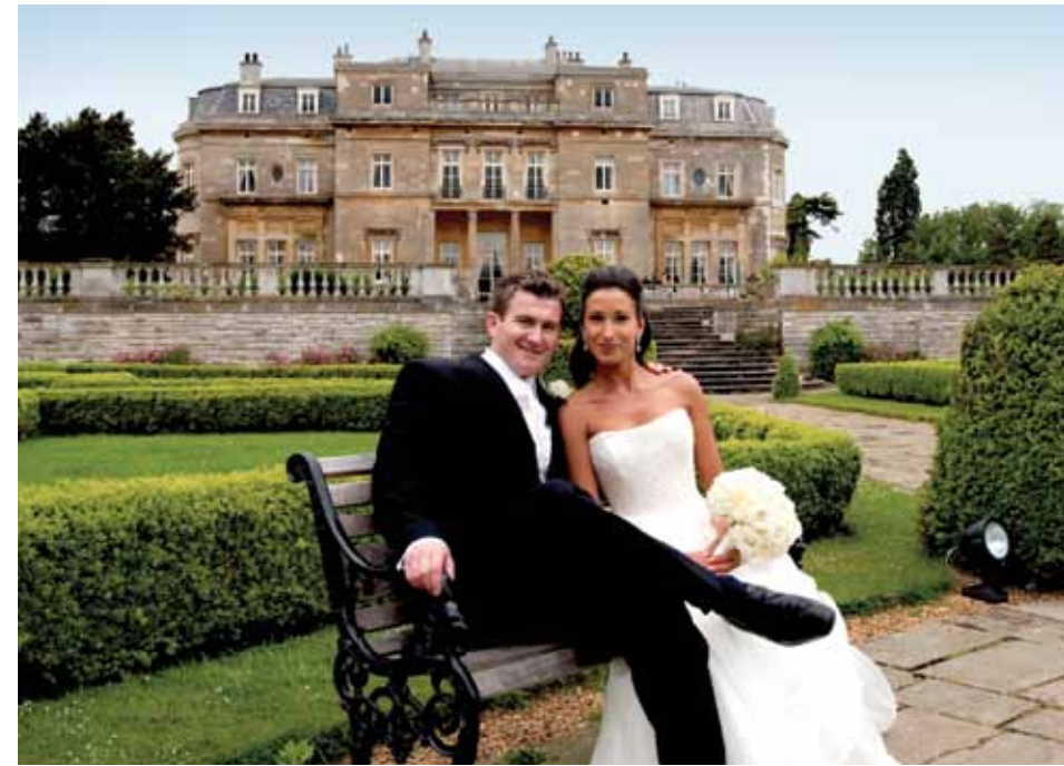
Mansion House Weddings

Our experienced team will pay attention to every detail and ensure you really do have the best day of your life.